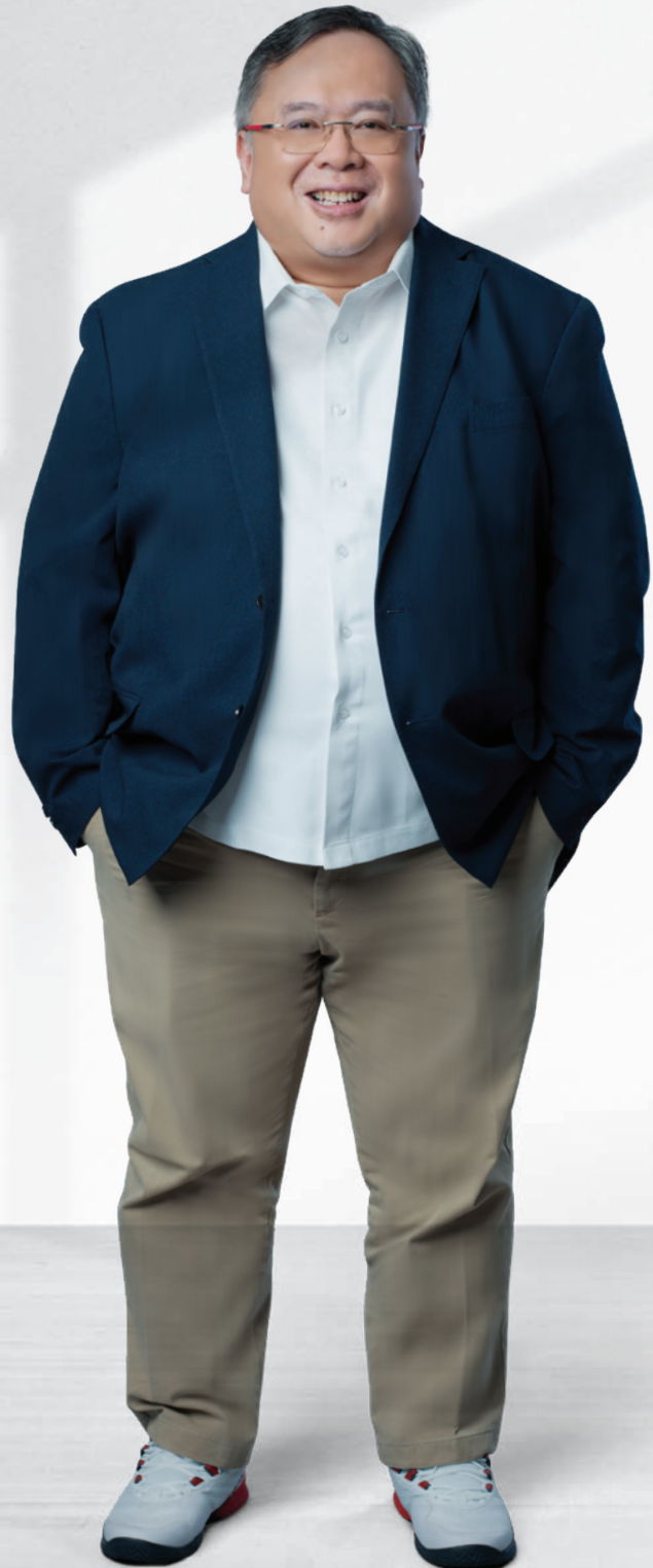
Bambang Permadi Soemantri Brodjonegoro

“ Telkom’s presence in society is committed to providing telecommunications solutions and creating a better and more sustainable future. The Board of Commissioners believes that a balance between the management of economic aspects and environmental, social, and governance (ESG) aspects will positively impact and add value to stakeholders and the environment.”